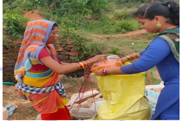
Training cum Demonstration of Mushroom Program conducted at Kadarpali village on 15.05.2023